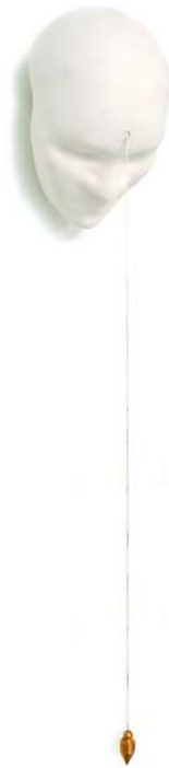
Terre cuite et fil à plomb , 2007